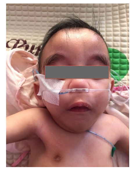
Figure 1: Figure shows clinical apperance of CNPAS such as small chin, widened forehead, low set ears